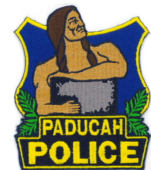
Paducah Police Department, a KLC Insurance Services 100% Safety & Liability Review Agency

WEAR YOUR VEST, WEAR YOUR SEATBELT, AND SLOW DOWN.