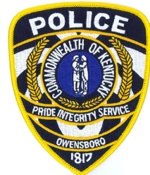
Owensboro Police Department, a KLC Insurance Services 100% Safety & Liability Review Agency