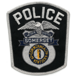
Somerset Police Department, a KLC Insurance Services 100% Safety & Liability Review Agency