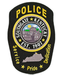
Southgate Police Department, a KLC Insurance Services 100% Safety & Liability Review Agency

WEAR YOUR VEST, WEAR YOUR SEATBELT, AND SLOW DOWN.