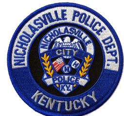
Nicholasville Police Department, a KLC Insurance Services 100% Safety & Liability Review Agency