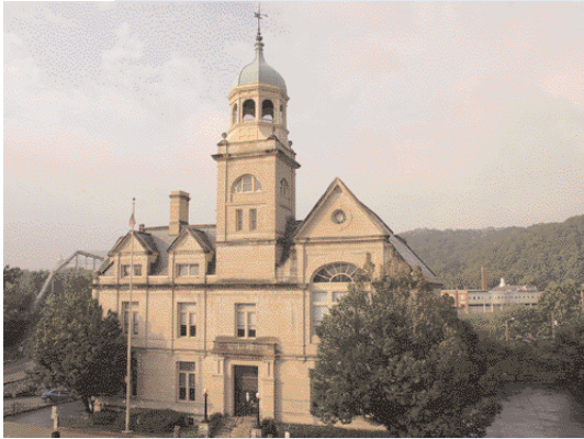
The old Federal Courthouse is home to the Paul Sawyer Public Library in Frankfort.

LOCATION: Kentucky's state capital sits in the Bluegrass region between Louisville and Lexington. It lies in a valley surrounded by woody hills and limestone cliffs carved by the Kentucky River. Away from the river, Frankfort also has miles of rolling hills and green farmland. Frankfort is considered to be one of the most picturesque state capitals.