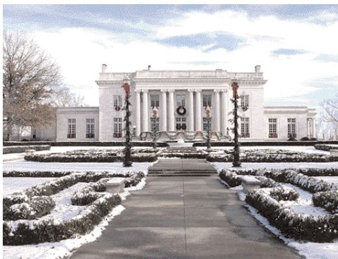
The Governor's Mansion is located at the top of Capital Avenue, overlooking the Kentucky River in Frankfort.

house is peach; another is gold with dark green shutters and a brick-red door.