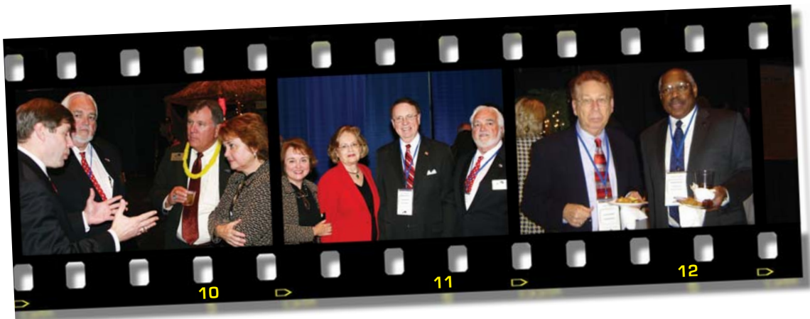
City Night photo cutlines (on back):