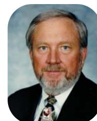
Minority Whip Joey Pendleton D-Hopkinsville

Visit www.klc.org to sign up for legislative alerts during the session.