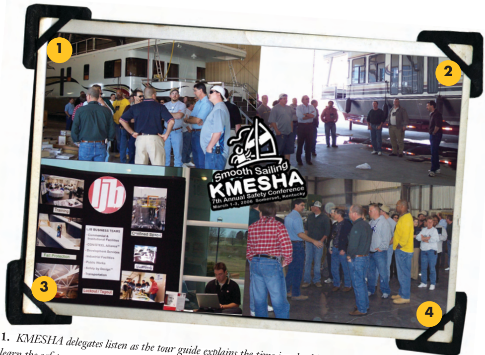
1. KMESHA delegates listen as the tour guide explains the time involved in customization of houseboats; 2. Delegates learn the safety measures involved in houseboat transportation; 3. Exhibit booths featured safety equipment, products and services; 4. KMESHA delegates gather to begin the Somerset Houseboat Safety Tour.

Highlights of the conference included plant tours of Somerset Houseboats, Play Mart Playgrounds, Inc. (playground equipment), Somerset Recycling and a fireworks safety demonstration by Lansden-Hill Pyro shows.