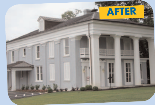
Harrodsburg: This recently renovated historic site is now used for local economic development and tourism office space. Financed and insured by KLC.