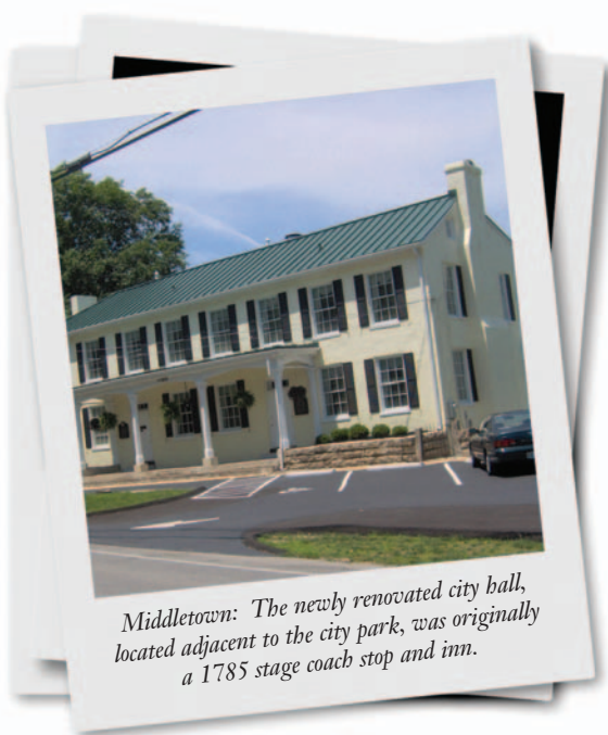
Middletown: The newly renovated city hall, located adjacent to the city park, was originally a 1785 stage coach stop and inn.