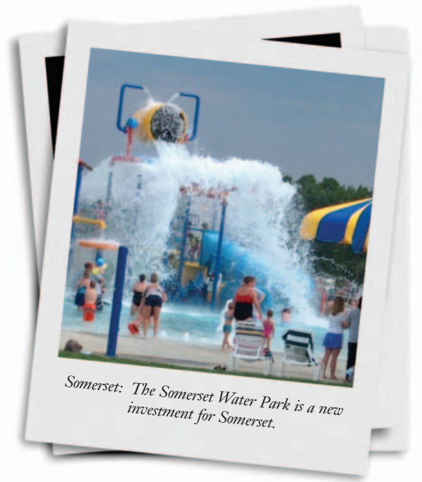
Somerset: The Somerset Water Park is a new investment for Somerset.