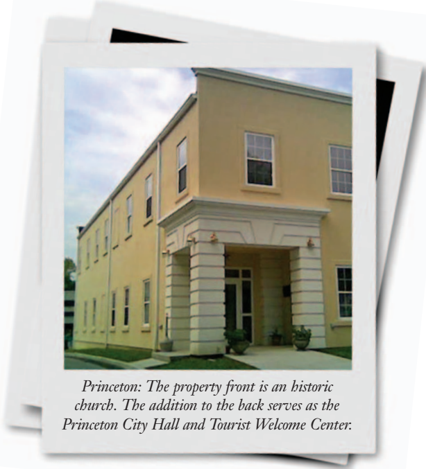
Princeton: The property front is an historic church. The addition to the back serves as the Princeton City Hall and Tourist Welcome Center.