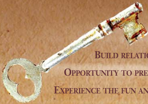
EXHIBIT WITH KLC!

EXPOSURE TO MORE THAN 1,200 CITY OFFICIALS